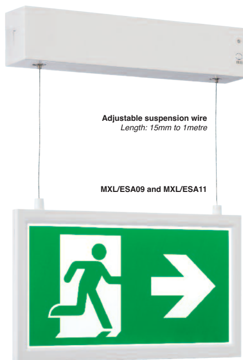
Adjustable suspension wire Length: 15mm to 1metre