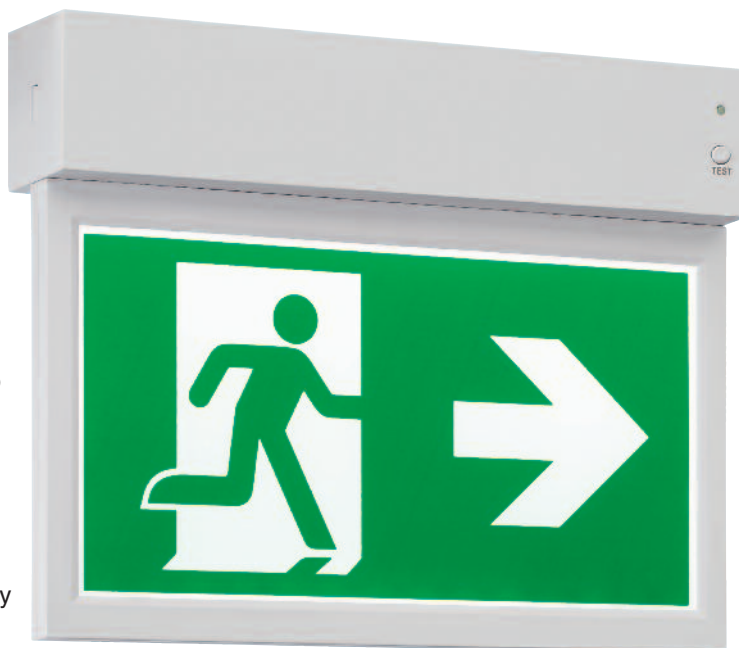
MXL/ESA08 and MXL/ESA10