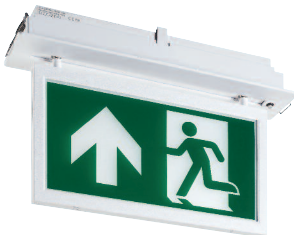
MXL/ESA11/M3/R (using /R recessing accessory)

MexLITE Exit Signs can be supplied with a ceiling recessing accessory allowing the standard body to recess into a ceiling cut-out mounting bracket. This feature is ideal for applications requiring a more aesthetic installation.