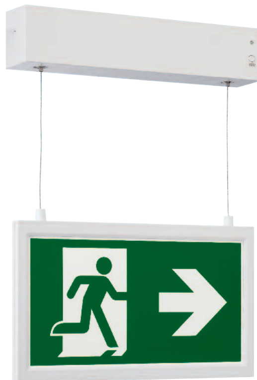
MXL/ESA09/M3 (small) MXL/ESA11/M3 (large)