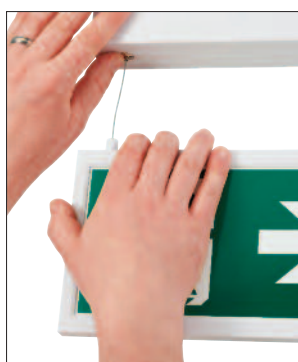
Simple height adjustment