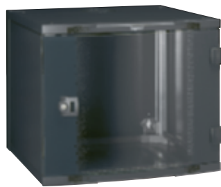
0 462 11