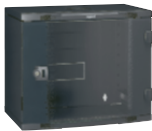
0 462 01