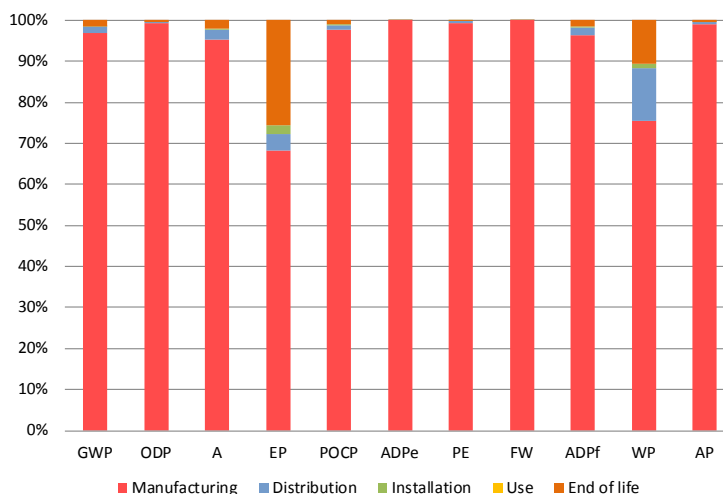
% Environmental Impact per Life Cycle Stage of Reference Product

The environmental impact of the Reference Product occurs predominantly during the Manufacturing phase.