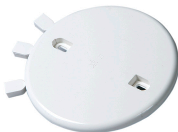
02 AK1.1 White cover for junction box

White covers for junction boxes get a new black addition.