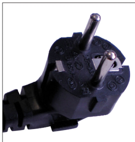
2 Pin DIN49441 Plug