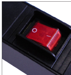
LED Shrouded Switch