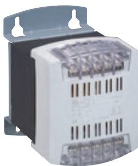
0 442 68