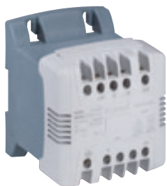
0 442 14